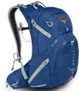
20-30 L Pack w/hipbelt