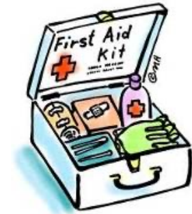
First Aid Items